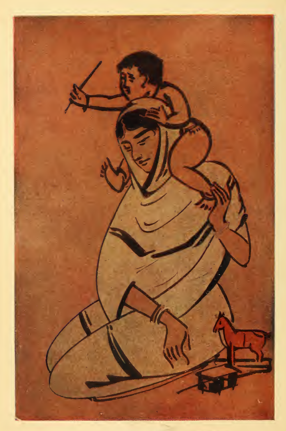
THE HOME. From a drawing by Nandalall Bose.